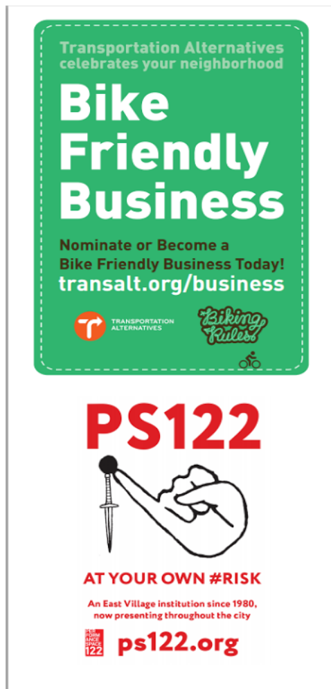
C. Large Color Ad, Half Page